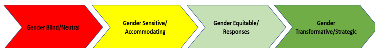
FIGURE 1: TRAFFIC LIGHT SCALE FOR GENDER SENSITIVE POLICIES